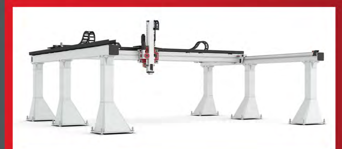
FOR LARGE PARTS