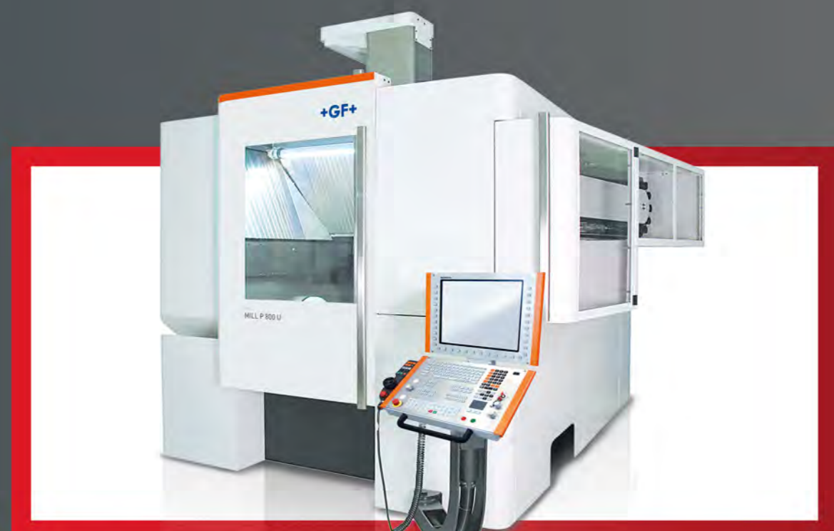
SMALL TO MEDIUM SIZE PARTS